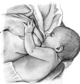
Sliding your finger between the baby's mouth and your breast releases the suction and detaches the baby comfortably, helping you avoid nipple pain.

To stimulate both breasts, alternate which breast you offer first. Some women like to keep a safety pin on their bra strap to help remember. While you should try to breastfeed evenly on both sides, many babies seem to prefer one side over the other and nurse longer on that side. When this happens, the breast adapts its milk production to your baby's feedings.